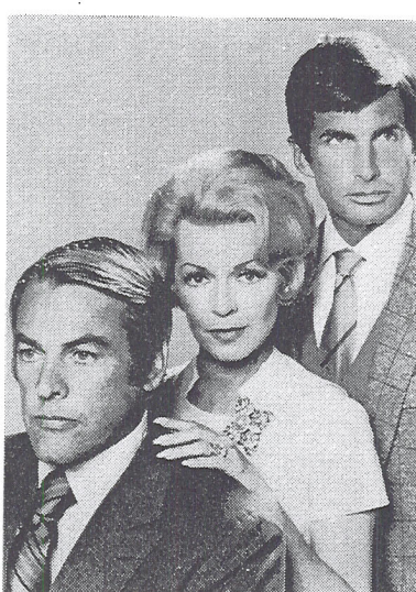
Locked into their time slots: NBC's Cosby, CBS's Nabors, ABC's 'Survivors'