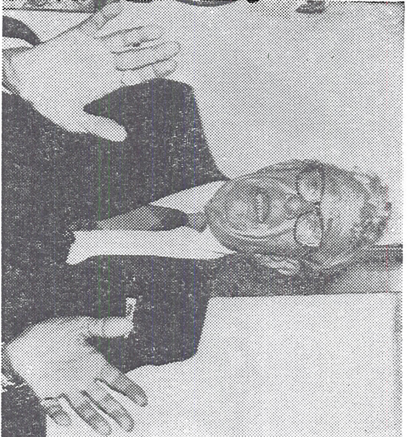
Senator Everett M. Dirksen, Republican minority leader, discussing the incident. He said diplomacy, not military action, should be first course considered by the President.

The White House said Mr. Nixon was watching the situation closely since he was awakened early by Mr. Kis-