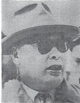
CHEN YI A warning to Washington

"Why was President Kennedy murdered and why is this case of murder not