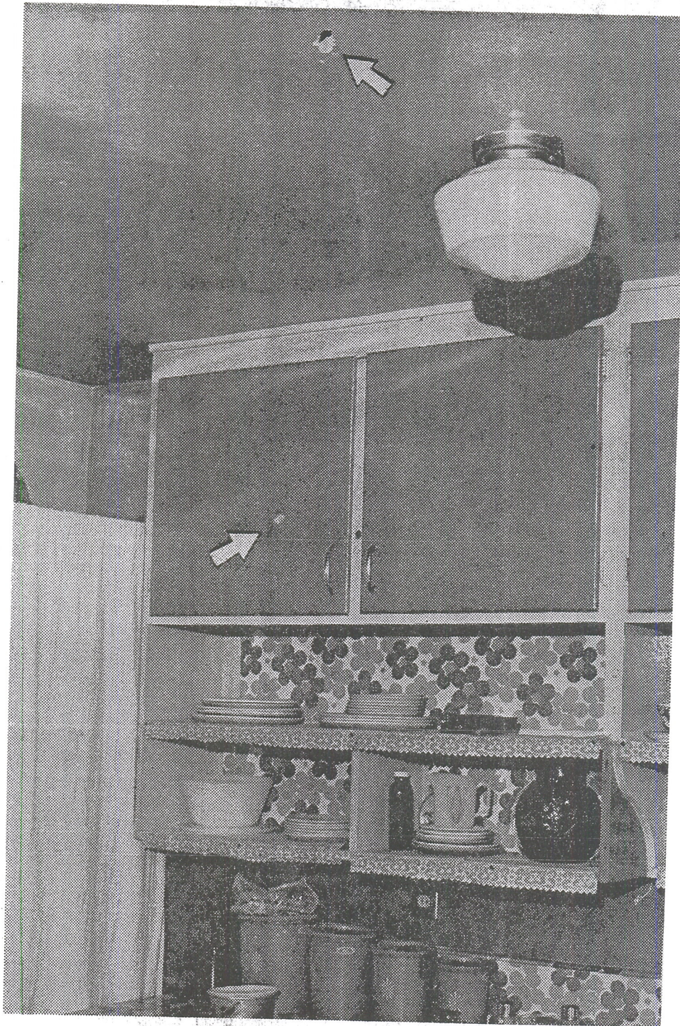
The bullet that killed Clarence Johnson went through his head, sped on through an open second-floor window in this Reardon road apartment, entered the ceiling (top arrow), ricocheted off a steel beam and, finally, lodged in a kitchen cabinet door (lower arrow).