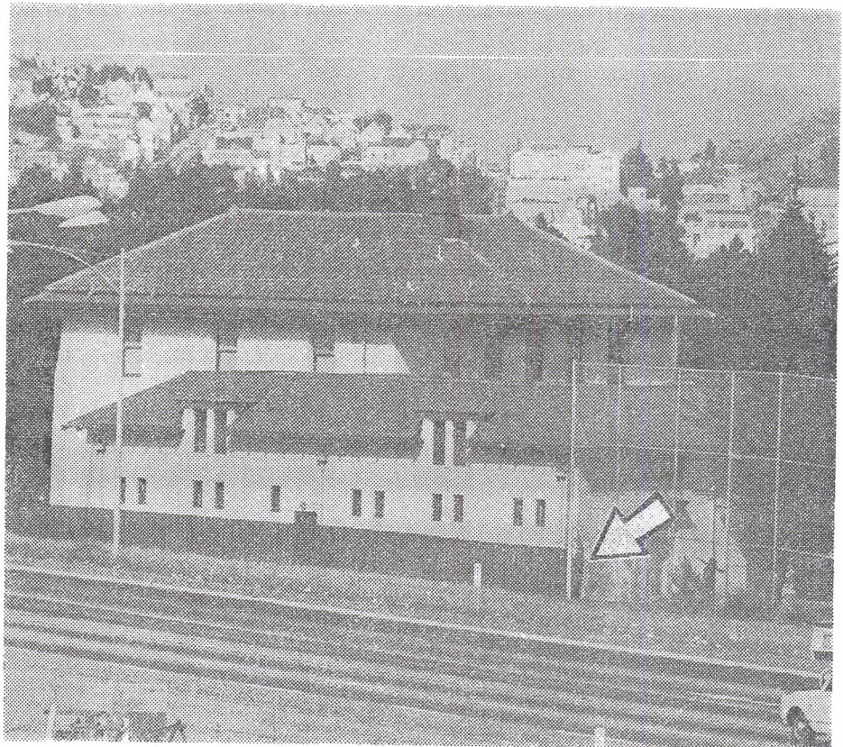
A shotgun-armed guard patrolled near the spot (arrow) where a hole was cut in the Ingleside station's protective fencing