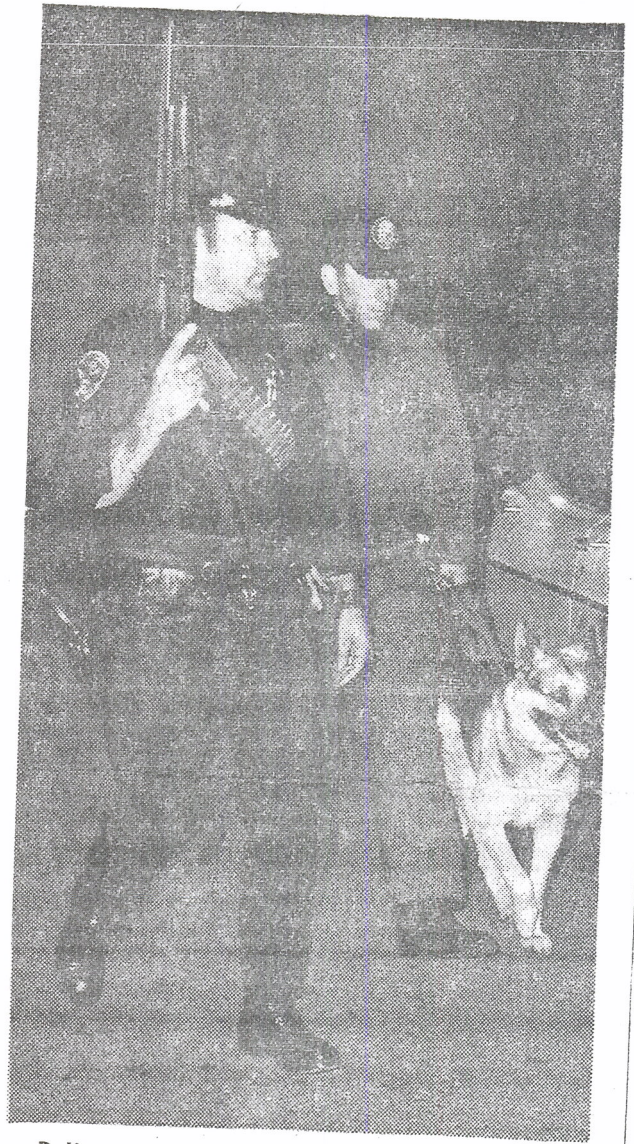
Police with dogs moved out of the Ingleside station to begin hunt

Within an hour after the shooting, Mayor Joseph Alioto said he would authorize the immediate posting of a city-sponsored reward for information leading to the arrest and conviction of the persons involved in the incident.