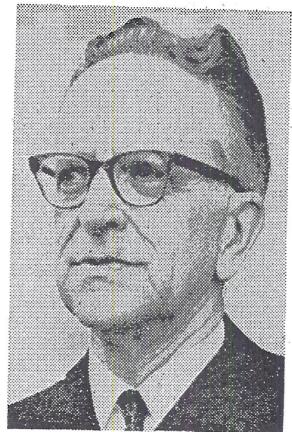
DISSENTERS: Chief Justice Warren E. Burger, at left, and Justices John M. Harlan, center, and Harry A. Blackmun