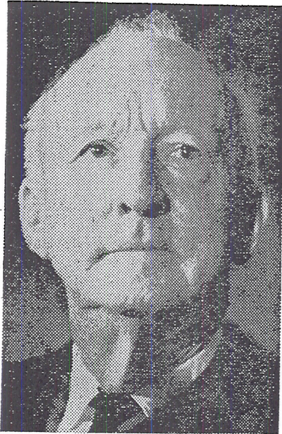
The New York Times