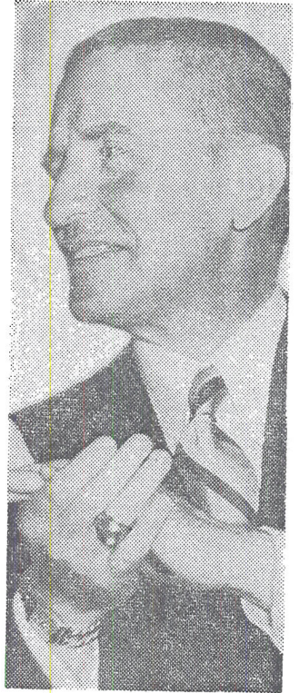
H. ROSS PEROT Millionaire sponsor

Speaking of the Green Beret raiders, Risner said: "They didn't get us out but they got us together . . . they got the North Vietnamese a little goosey . . . they moved us all into the infamous Hanoi Hilton and for