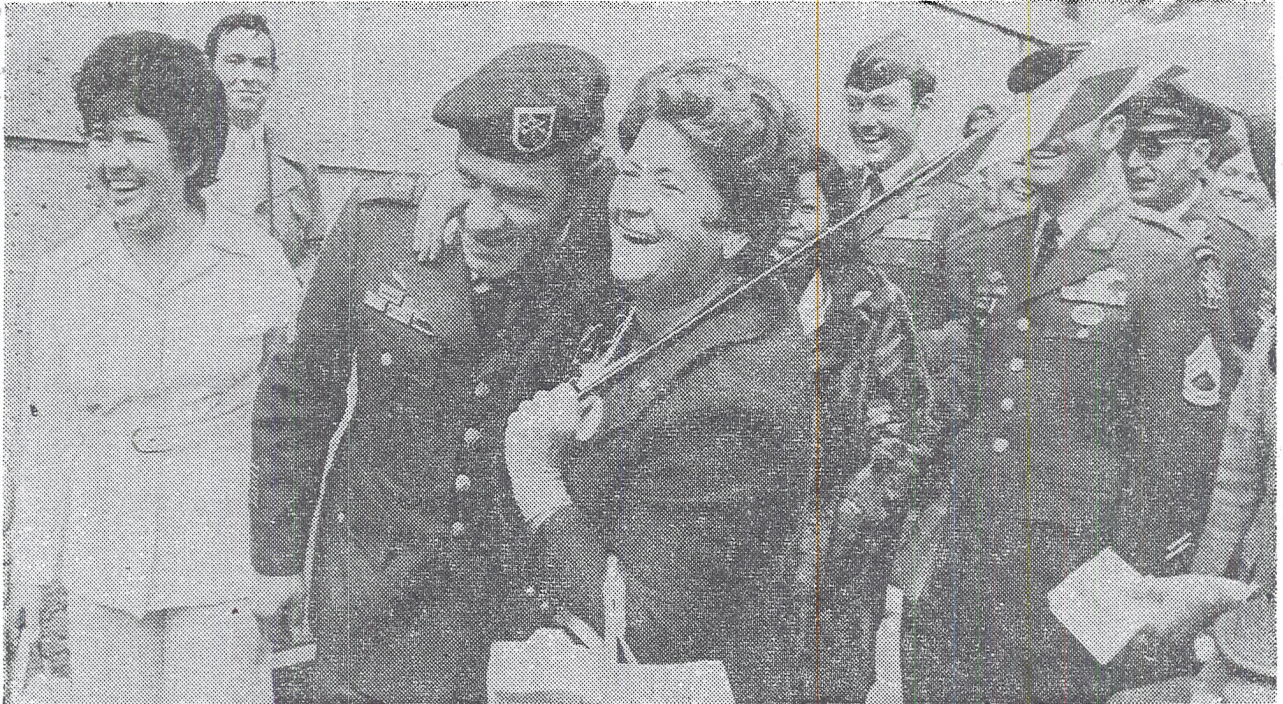
A Green Beret who made the Son Tay raid was embraced by a flag-waving woman