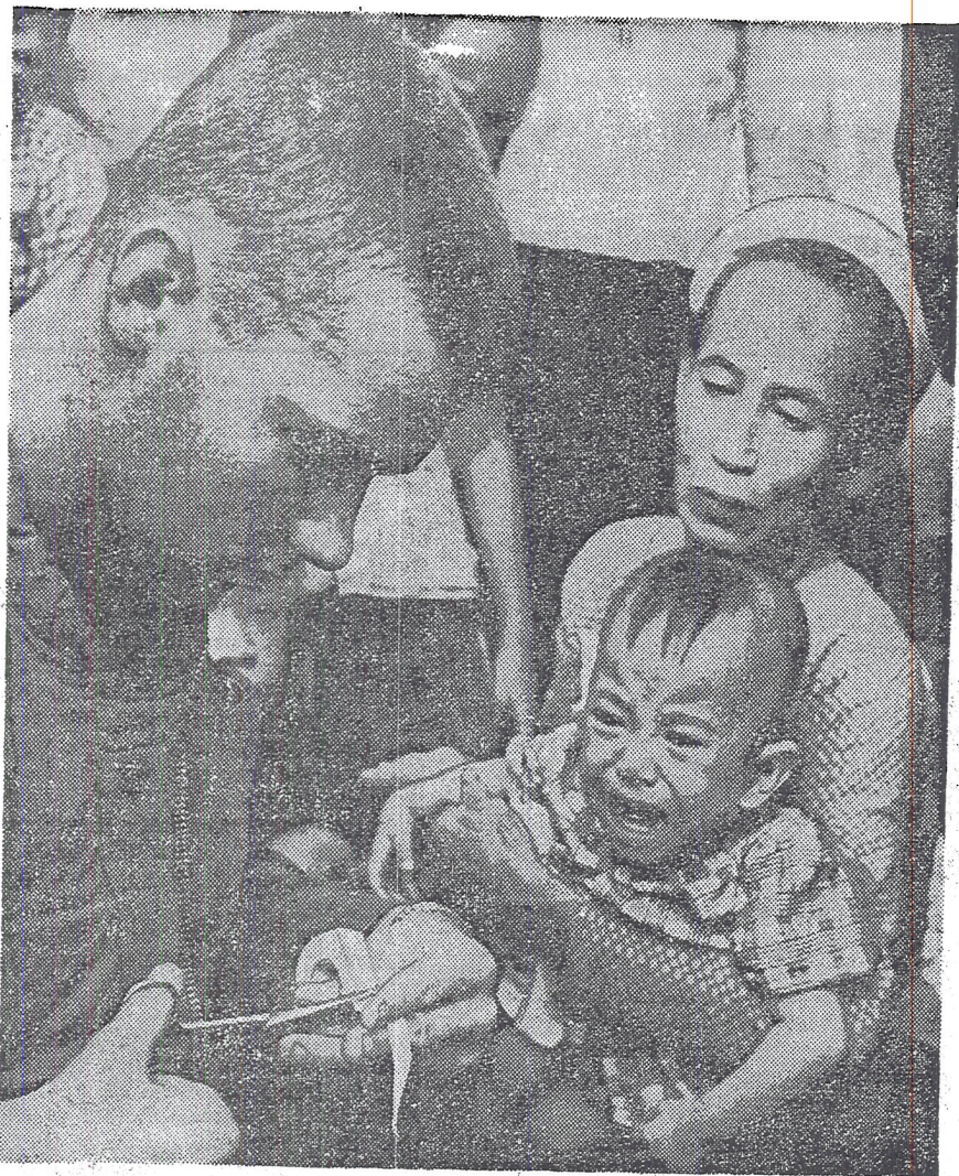
United Press International