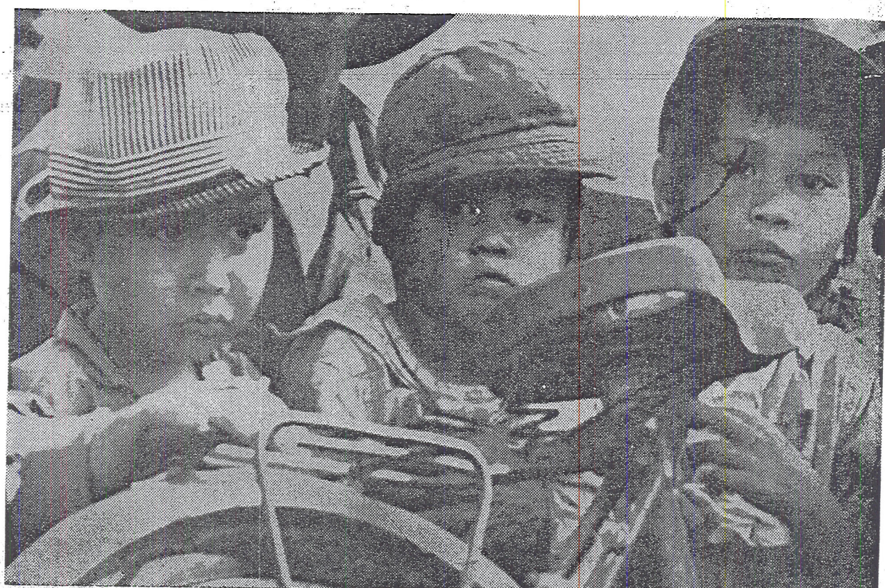
Refugee Boys at Hue