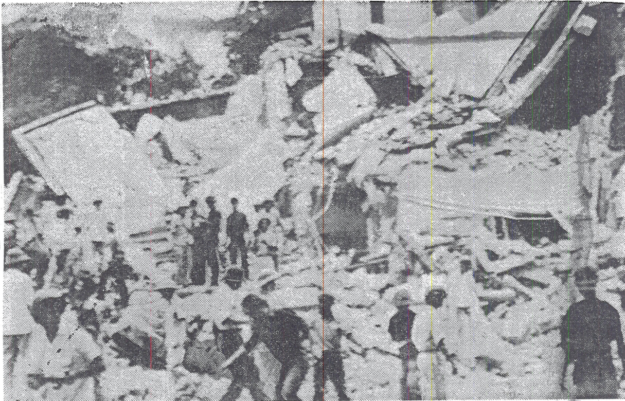
This photo from Hanoi was identified as showing the rubble of the French diplomatic building

The extent of the damage was made apparent during the night as giant cranes