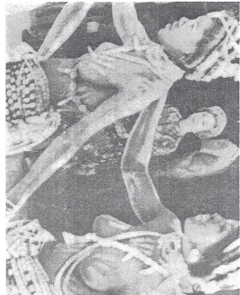
Mrs. Nixon watched a bare-breasted snake dance in Monrovia