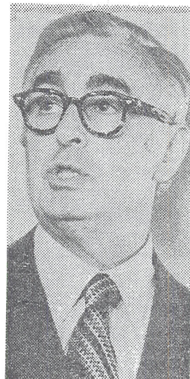
SENATOR RIBICOFF "Terribly impressed"