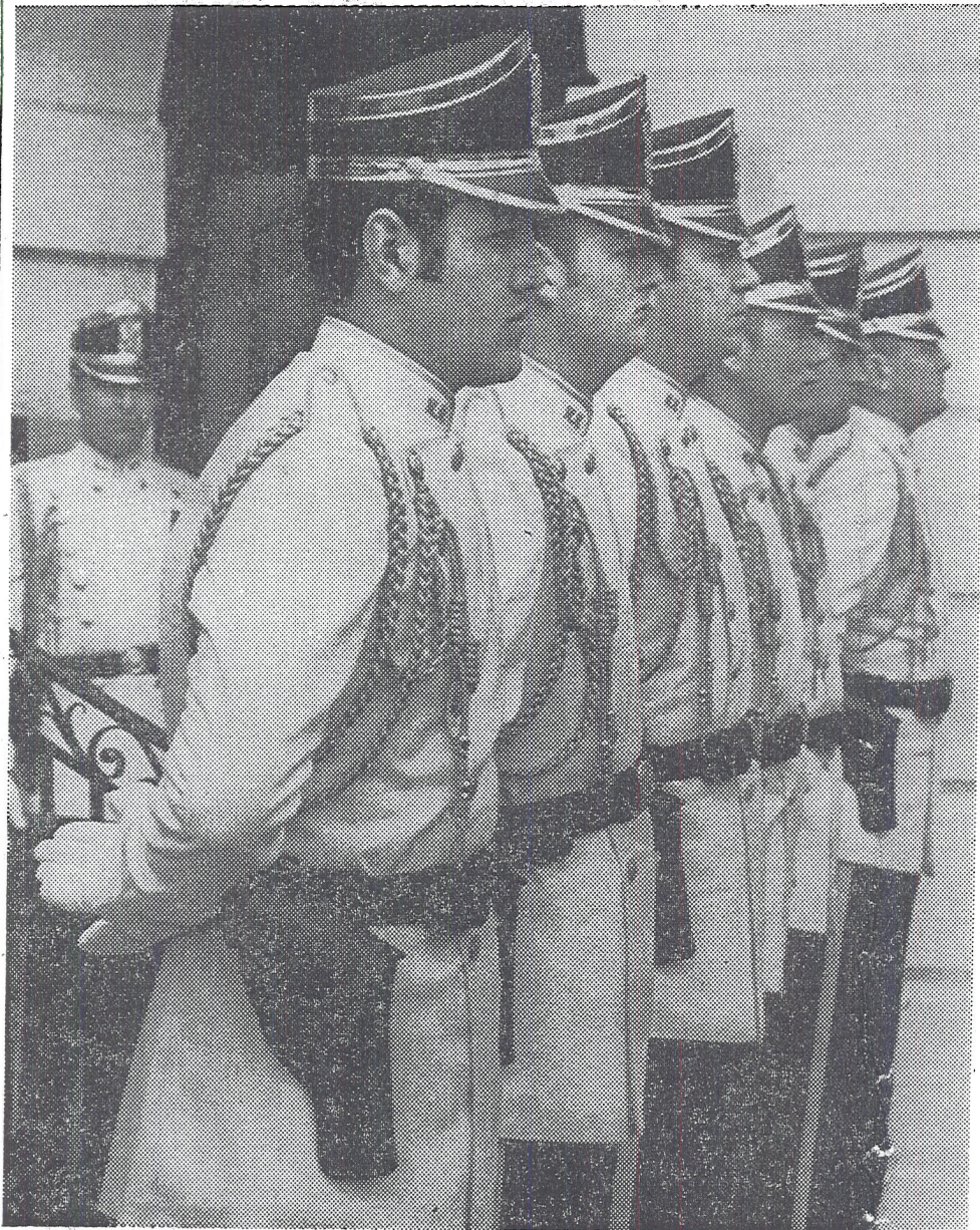
ON CEREMONIAL DUTY: White House policemen participating in the welcome to Prime Minister Wilson of Britain, and wearing the new uniforms ordered by the President.