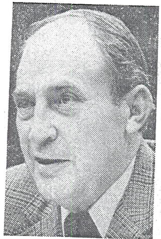
William Saxbe, right, now Attorney General-designate, criticized the appointment of Roy Ash as OMB director.

"That is an immensely responsible job. And it does take just the kind of vigilance that seems to have been missing in this case."