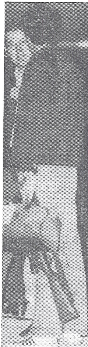
F.B.I. agents armed with rifles at McCoy Air Force Base in Orlando Saturday.