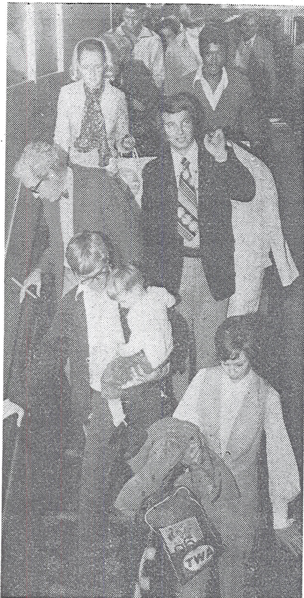
Passengers ride escalator to airport customs area