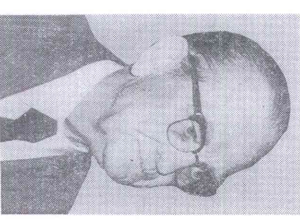
Sen. Stennis Knows where the bodies are buried

It is therefore a warning signal as loud and clear as a fire siren that Stennis has refused to commit himself to approval of Gen. Creighton W. Abrams as Army