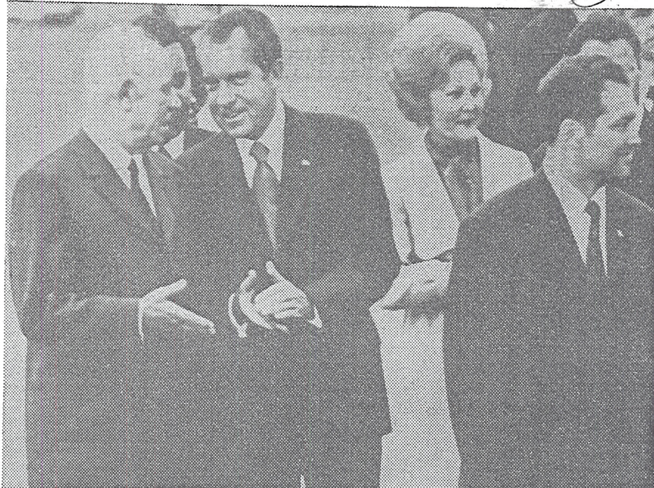
United Press International