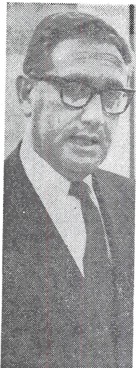
Kissinger today (left) and in 1950 (below) in his Harvard graduation picture.