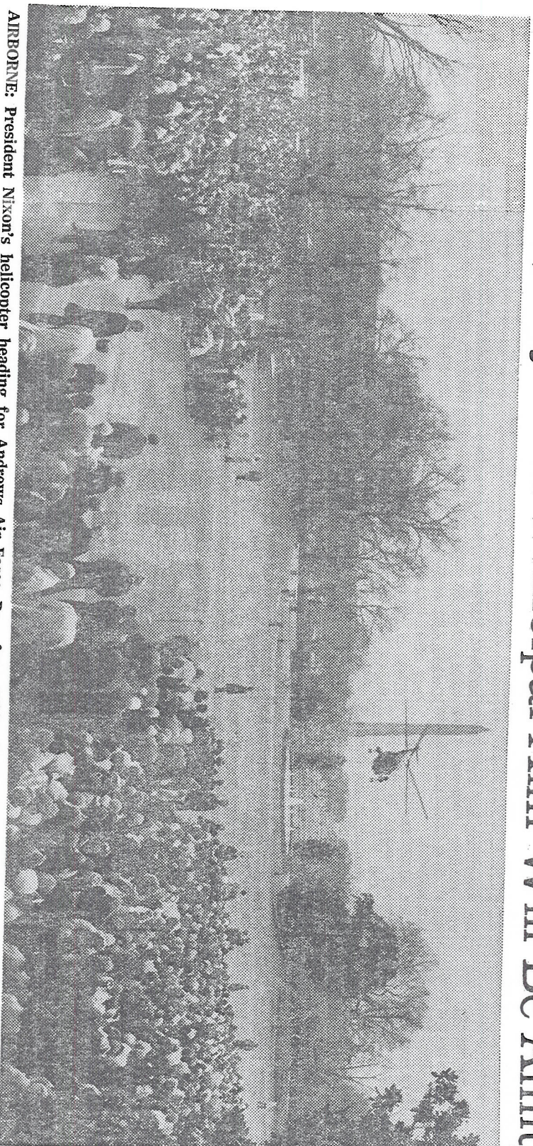
AIRBORNE: President Nixon's helicopter heading for Andrews Air Force Base from White House lawn. Invited guests gathered for the event.