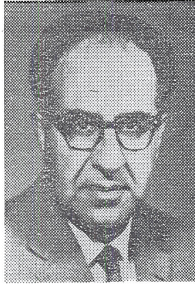
Philip C. Habib Expected to go to South Korea.

Mr. Barbour, a career diplomat who has been in poor health recently, has occupied the sensitive Tel Aviv post for more than 10 years—longer than any other American ambassador now overseas. He has served three presidents and managed to maintain his credibility and