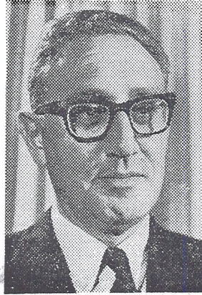
Henry A. Kissinger Presumably the man for Peking tour.

influence with the Israelis, an achievement his State Department colleagues regard as extraordinary.