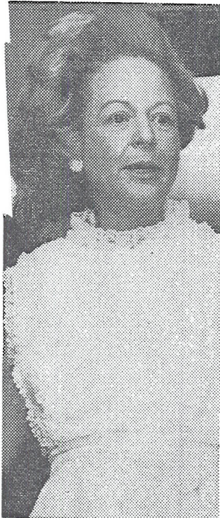
United Press International