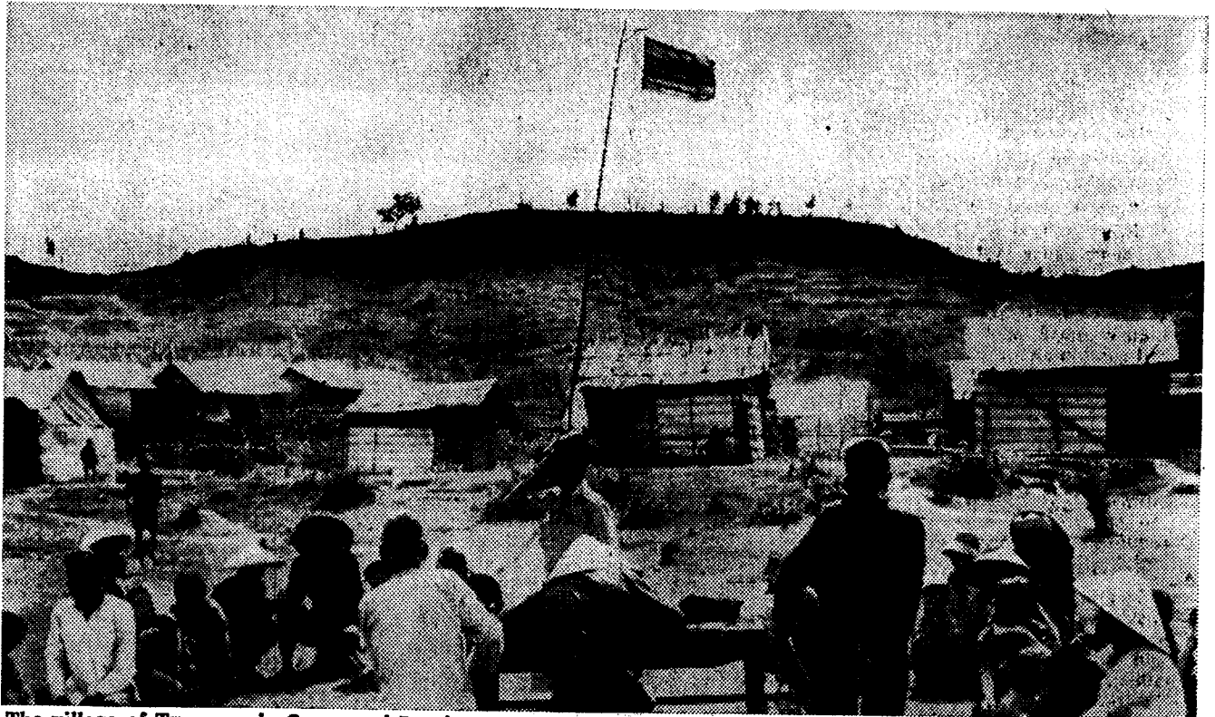
The village of Truongan in Quangngai Province, South Vietnam, is the new home of the residents of Songmy, a nearby village. A group of the villagers reported that U.S. troops slew 567 unarmed civilians there on March 16, 1968.