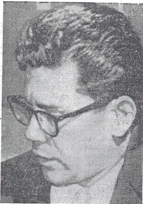
ERNESTO MIRANDA IN 1967 Man of contradictions

In 1966, the Supreme Court overturned Miranda's rape conviction, ruling that his confession was illegally