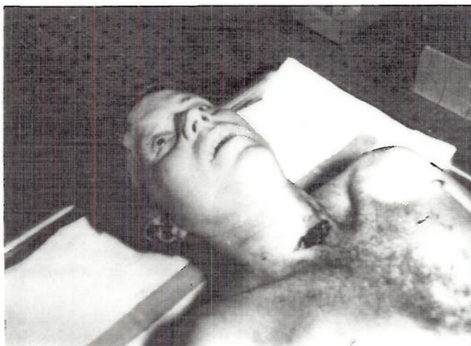
13. Deceased. The body of the late President prior to the autopsy.