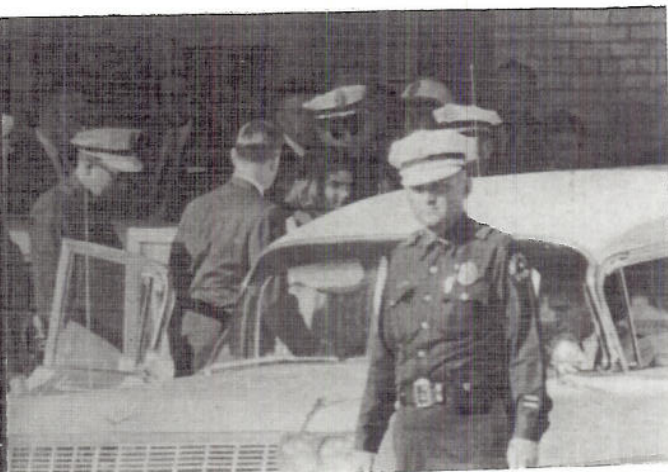
11. Aftermath. Jackie Kennedy exiting Parkland Hospital via the white hearse containing the President's body.