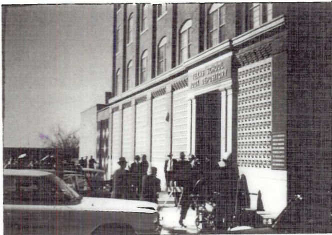
10. Aftermath. Taken at 12:45 p.m. of the TSBD looking down Elm Street extension.