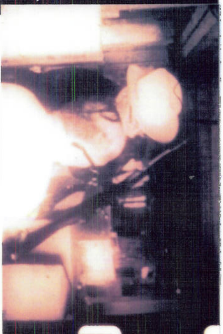
9. Aftermath. Lt. Day examining the rifle found on the 6th floor.