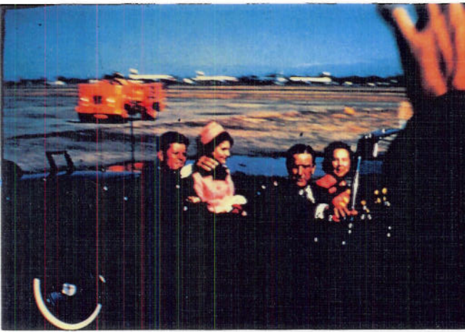
1. Departure. Presidential party leaving Love Field Airport.