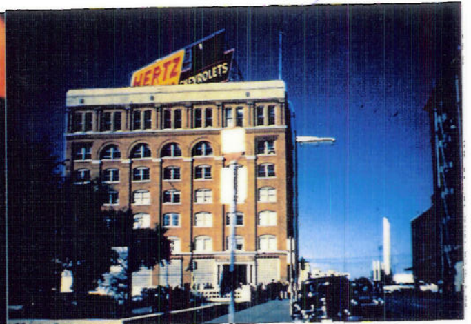
2. Aftermath. Taken on the day of the assassination late that afternoon, of the TSBD.