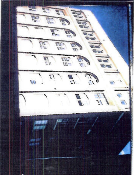
8. Aftermath. Taken approximately 30 seconds following the assassination.