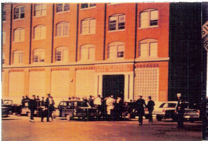
4. Aftermath. Taken from the intersection of the TSBD.