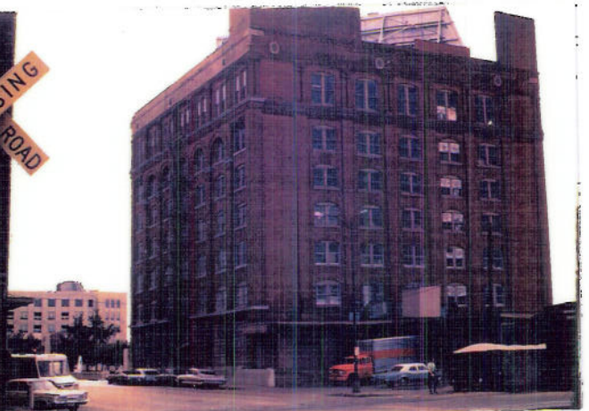
5. Research. Taken for research work of back of the TSBD in the late 1960's.