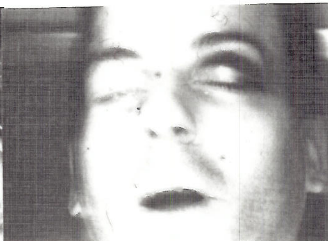
14. Deceased. The body of Lee Harvey Oswald following the autopsy.