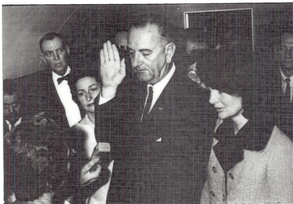
12. Aftermath. Lyndon B. Johnson taking the oath of office aboard Air Force 1 prior to departure at Love Field Airport.