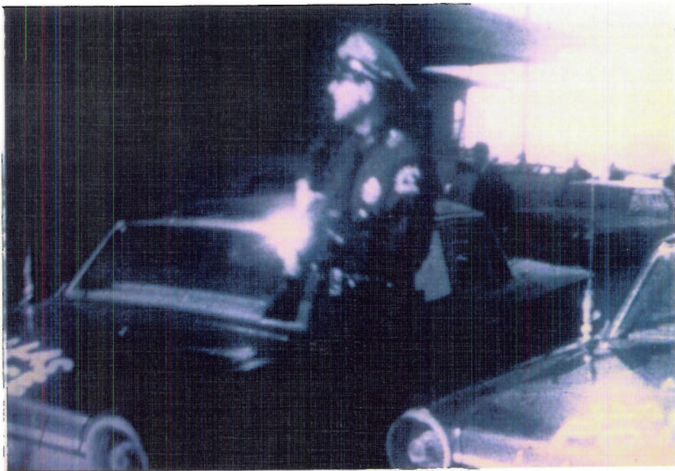
3. Aftermath. From the intersection of Houston & Elm Street, of the police surrounding the TSBD.