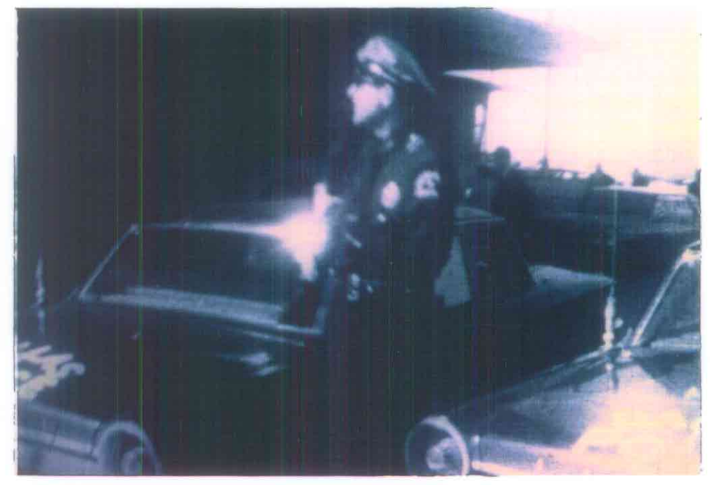
3. Aftermath. From the intersection of Houston & Elm Street, of the police surrounding the TSBD.