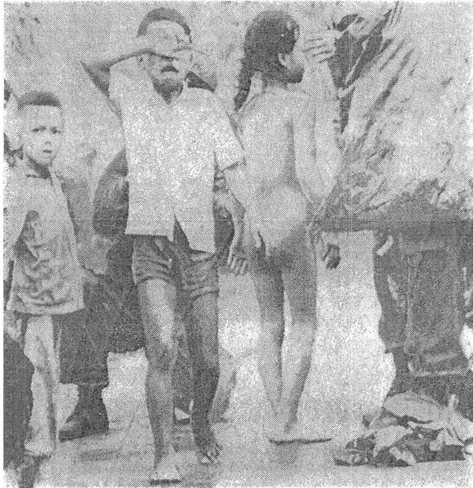
Soldiers treated a boy and a girl burned by the jellied gasoline