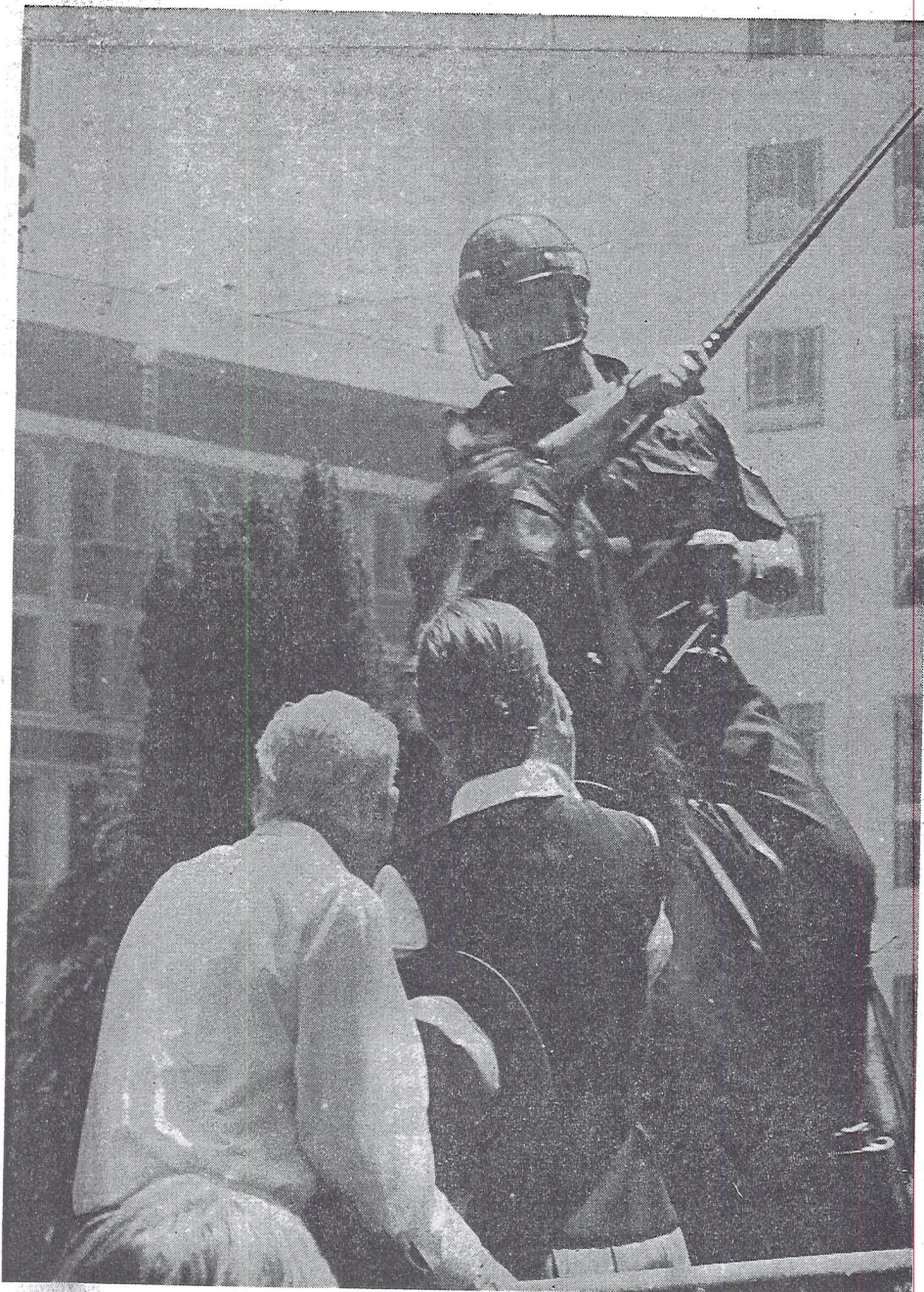
Mounted, baton-swinging police swept across the square, followed by officers on foot