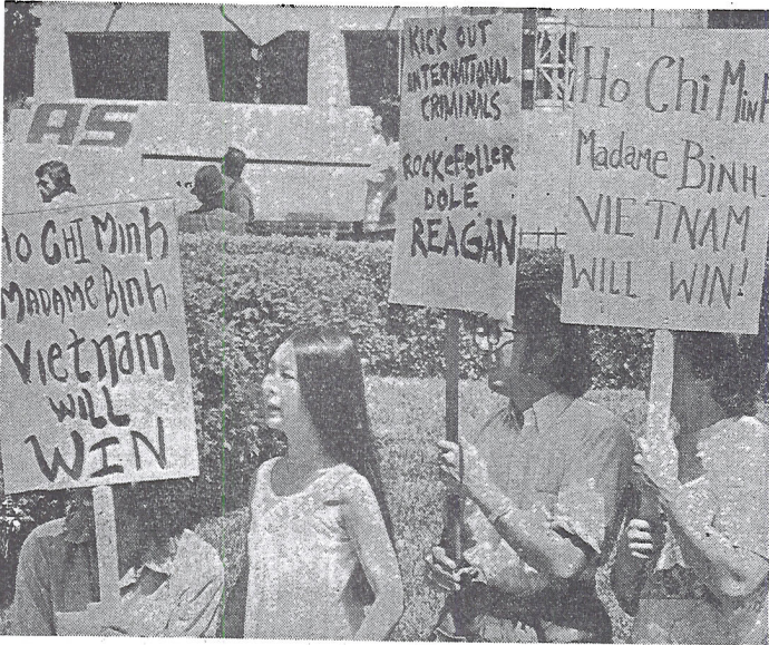
The crowd supported the Viet Cong but opposed visiting governors