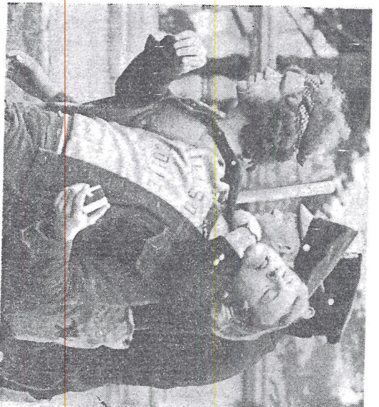
Police arrested two demonstrators early yesterday who had tried to block the 14th street bridge