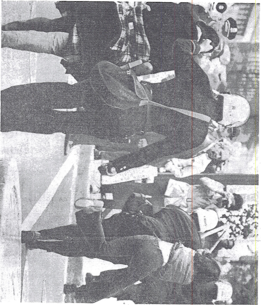
One demonstrator was carried over the shoulder and another was led away by the hair

failed. The 7,000 arrests appeared to be greater than that for any single event in the nation's history. The prisoners were being held in a football field and a jail exercise yard. They were being fed army C-rations and police said they would probably spend the night outside where temperatures are expected to drop into the 30s.