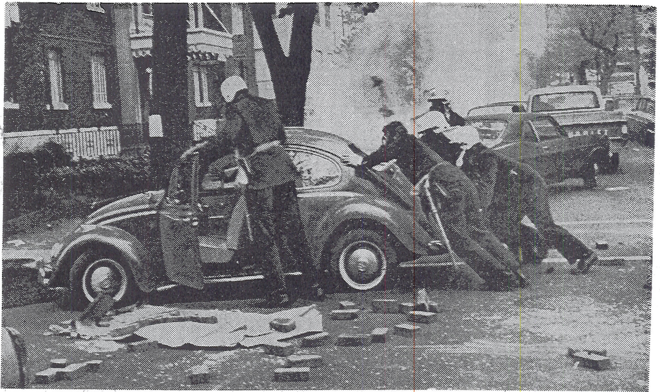
A car left by demonstrators as a roadblock is pushed off a Washington street by police