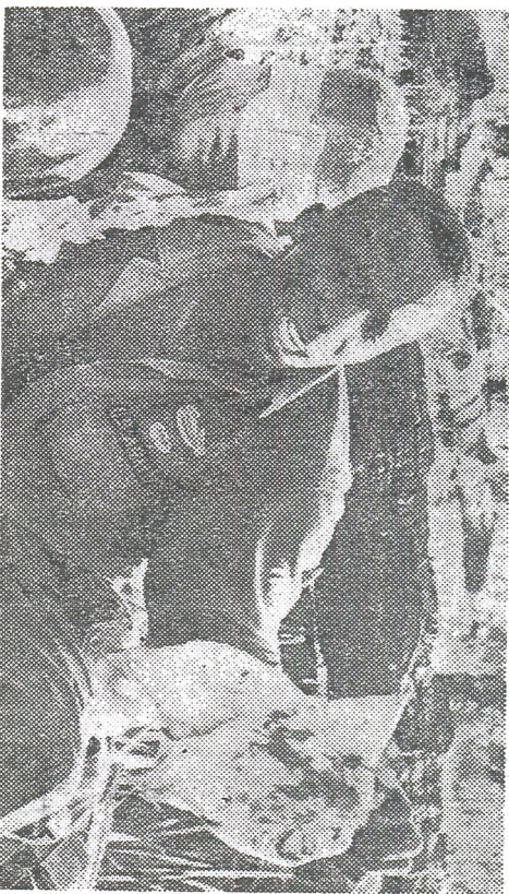
United Press International