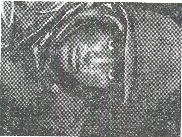
David Douglas Duncan

More than 56,000 Americans died and more than 300,000 were wounded in the eight-year war. G.I.'s knew pain, anguish, fear; the anguish reflected in the face of a medic helping a wounded comrade; the fear in the eyes of a marine under fire at Con Thien. But those who returned knew the joy of reunion with their families, a joy tempered by the memory of their sacrifice.