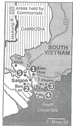
The New York Times/April 28, 1975

In Saigon (larger map) a slum around national police headquarters was hit hardest by rockets. Another rocket demolished top floor of Majestic Hotel. Many foreigners are housed in hotels along Tu Do Street. In other areas (smaller map), Communist forces drove to Bien Hoa (1) in the northeast and to Ben Luc (2) to the southwest, coming within 12 miles of the capital. Later they invaded Phuoc Le (3) and thus cut off the port of Vung Tau (4) from Saigon. Route 1 was reported cut at Cu Chi (5).