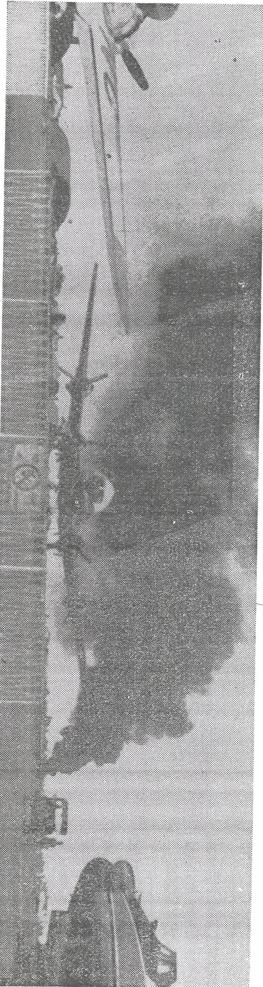
Smoke rising from a rocket that hit the edge of Pochentong Airport, Phnom Penh, Tuesday. The airlift of food and ammunition continued yesterday, but at a reduced rate