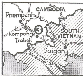
The New York Times Feb. 26, 1971 Base north of Route 9 in Laos (1) was assaulted. Saigon units were still reported 16 miles from border (2). In Cambodia, new drive was under way at Kompong Trabek (3).