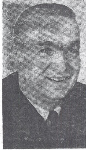
JUDGE HALLECK Before transformation

40 San Francisco Chronicle Thurs., Nov. 26, 1970