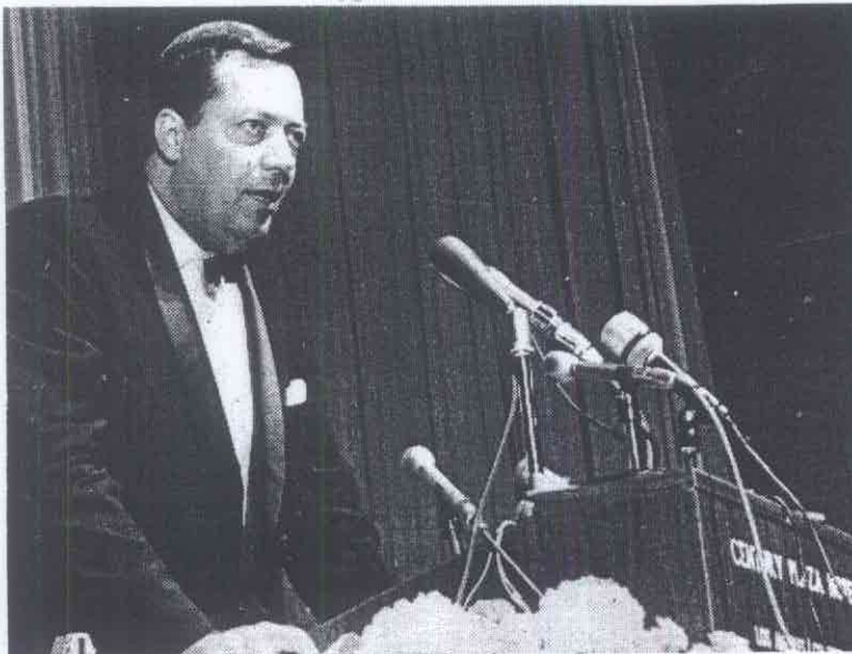
New Orleans' District Attorney Jim Garrison spoke Tuesday night at Century Plaza Hotel about his Kennedy Assassination probe.

government did in the Kennedy assassination, and it was a well-planned assassination, involving a number of individuals as you will learn, I assure you. What the government did, was to practice two essential actions to conceal the truth of the assassination.