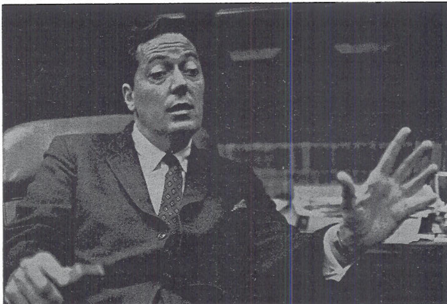
District Attorney Garrison: Who were the real plotters in New Orleans?