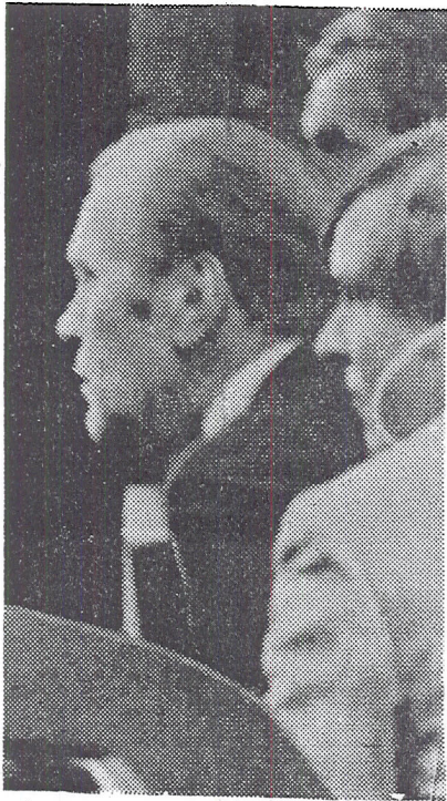
... and then ducked ...