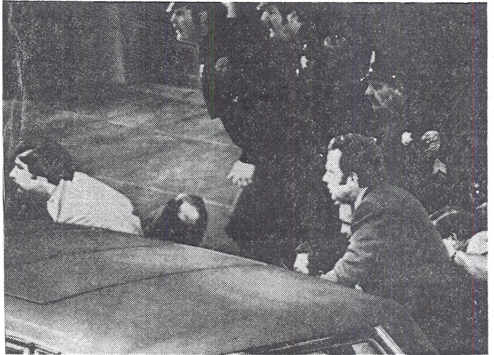
... as police and agents started to run toward the suspect.