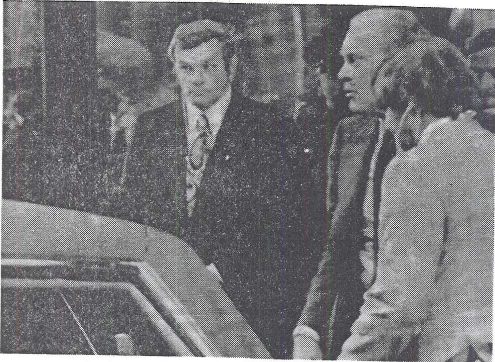
As the shot was fired, he glanced toward the sound . . .