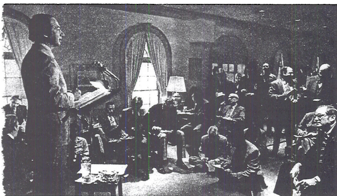
Nessen mounts the firing line twice a day to brief the White House press corps. He's a new man trying to handle a tough job and they give him a rough time.

Nessen, in short, has his work cut out for him. Compared to life on the White House firing line, daily serving three masters—the press, the President and himself—he will realize longingly, if he hasn't already, that working for NBC was a cool-cool breeze.