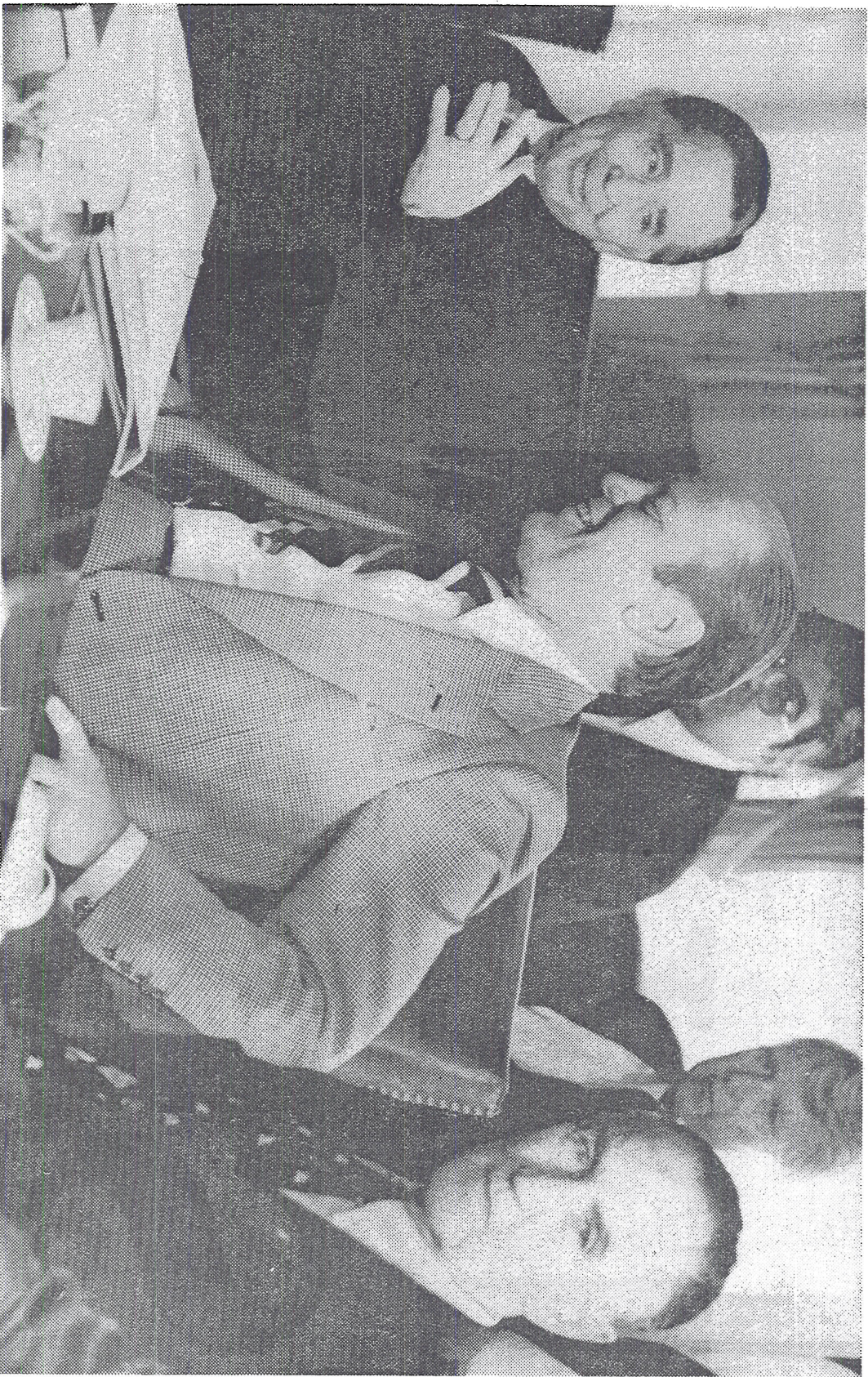
President Ford meets at the White House with House Speaker Carl Albert and Senate Majority Leader Mike Mansfield to discuss amnesty.