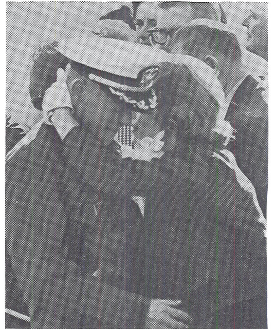
A KISS OF JOY. The skipper is welcomed home by his wife.