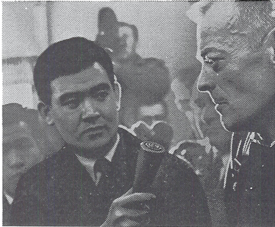
ANOTHER PRESS conference, this time in Seoul without the Glorious General .