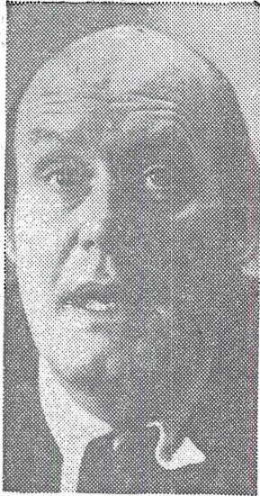
NICHOLAS KATZENBACH ...cites FBI memoranda