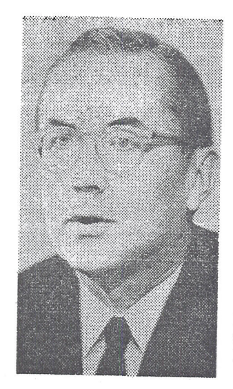
WILLIAM E. COLBY A busy week ahead