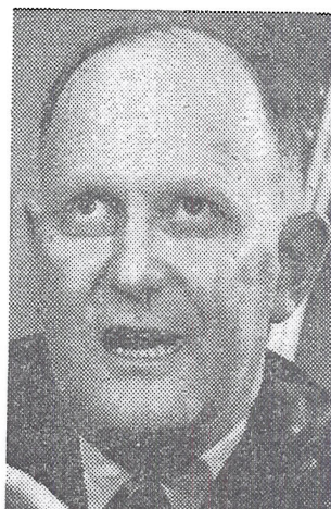
C. DOUGLAS DILLON ... treasury ex-secretary