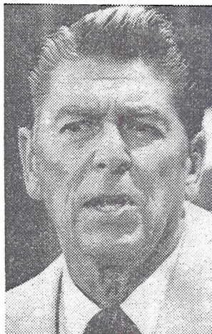
RONALD REAGAN ... outgoing governor