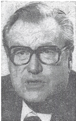
NELSON A. ROCKEFELLER ... Vice President presides

• Rockefeller has been a member of the President's Foreign Intelligence Advisory Board which is responsible for overseeing intelligence activities and making recommendations for change. Former CIA officer Victor Marchetti and John D. Marks in their book, "The CIA and the Cult of Intelligence," have charged that the majority on that board "has consistently pushed for bigger (and more expensive) intelligence collection systems."