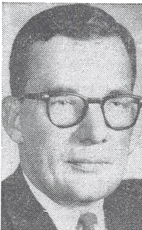
JOSEPH LANE KIRKLAND ... AFL-CIO secretary