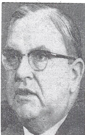
ERWIN N. GRISWOLD ... ex-solicitor general