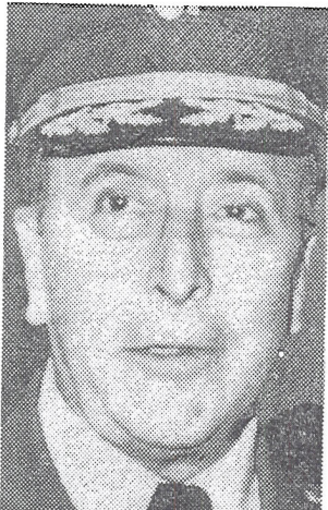
LYMAN L. LEMNITZER ... former Army chief