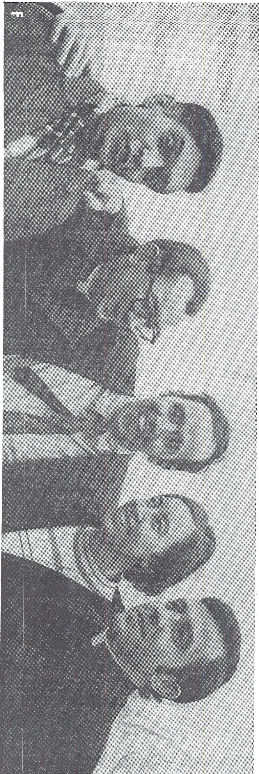
The "plot" to kidnap Henry Kissinger.