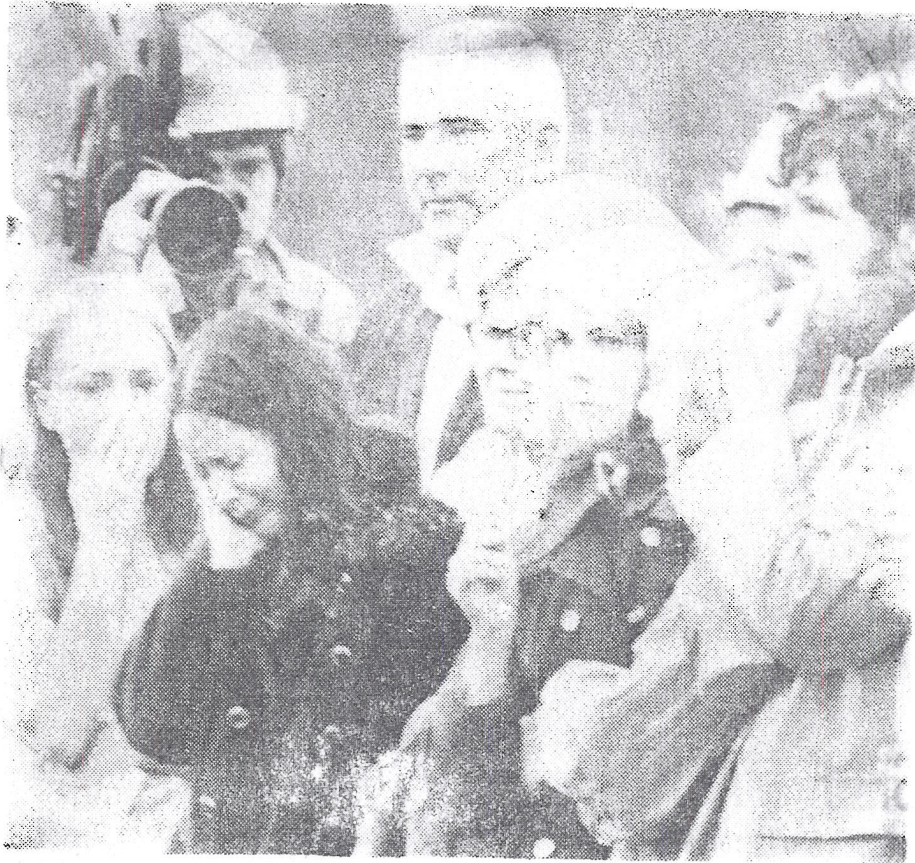
WAITING FOR NEWS—IT MAY BE TERRIBLE, IT MAY BE GOOD Relatives of hostages held in Attica gathered at prison gates