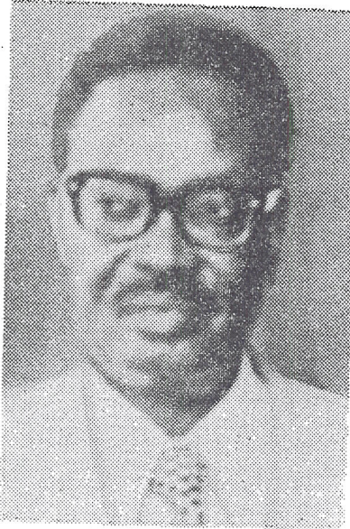
AGOSTINO NETO Radical doctor, poet

Additionally, the sources claim the operation thus far is a complete failure despite the U.S. involvement. Since November 11, when Portugal formally granted