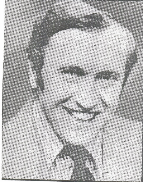
Victor Lasky (far left), a friend of Nixon's, and prosecutors George Frampton Jr. and Richard Ben-Veniste (left) have written books about the former president and his dealings with Leon Jaworski (top) and David Frost (above)