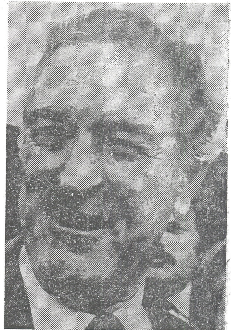
JOHN B. CONNALLY

... "I've seen this system of ours work"