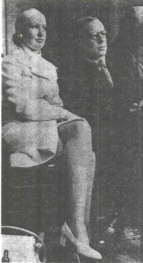
John Dean waits with his wife "Mo" to testify before the Senate Watergate panel. The former White House counsel surrendered Sept. 3 to begin serving his one-to-four-year prison sentence.

What is certain is that John Dean will write his memoirs in jail—he has been sentenced to from one to four years—and that his book will surely explain,